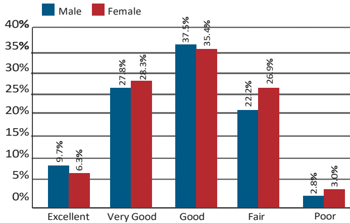
Figure 2. Percent of Males and Females Indicating Perceived Health Status, Who Visited a Dentist or Dental Hygienist in the Past Year and Gender